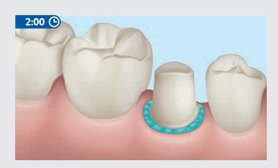
Leave the paste to work into the sulcus, to enable the gingival retraction.