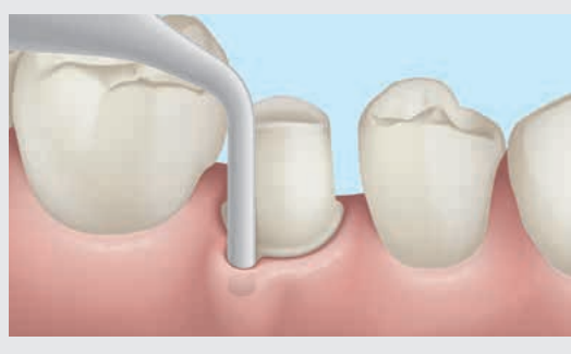
Compule tip inserted into the sulcus.