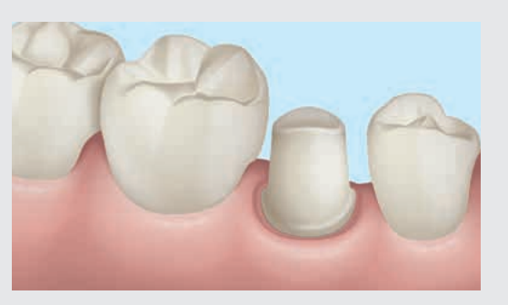
The tissue is retracted mechanically.