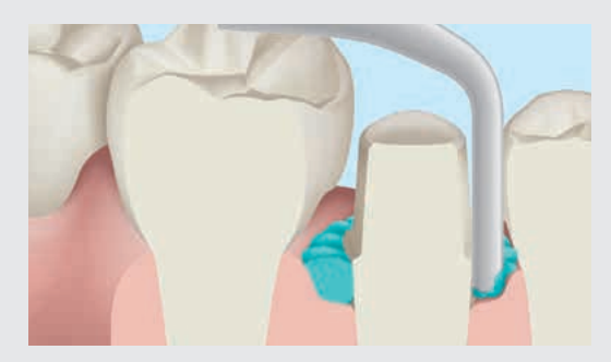
Apply the retraction paste.